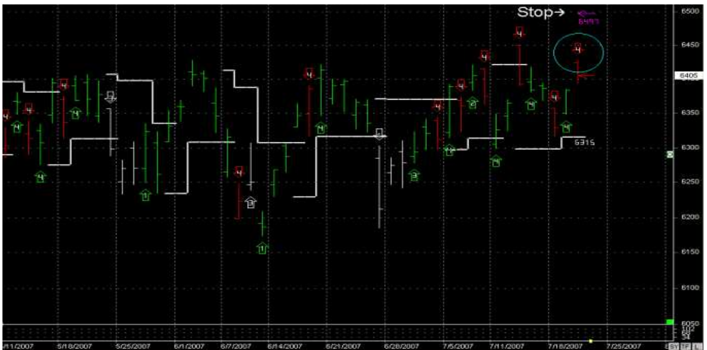
SPI daily charts and AMT system

The system is a swing-based system that trades 1-3 contracts for longs and 1-2 contracts for shorts, and it has a historical profitability of 60% since 1991